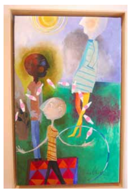
Juggler in the Park