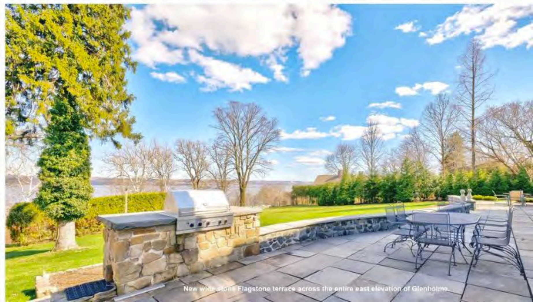
New white stone flagstone terrace across the entire east elevation of Glenholme.