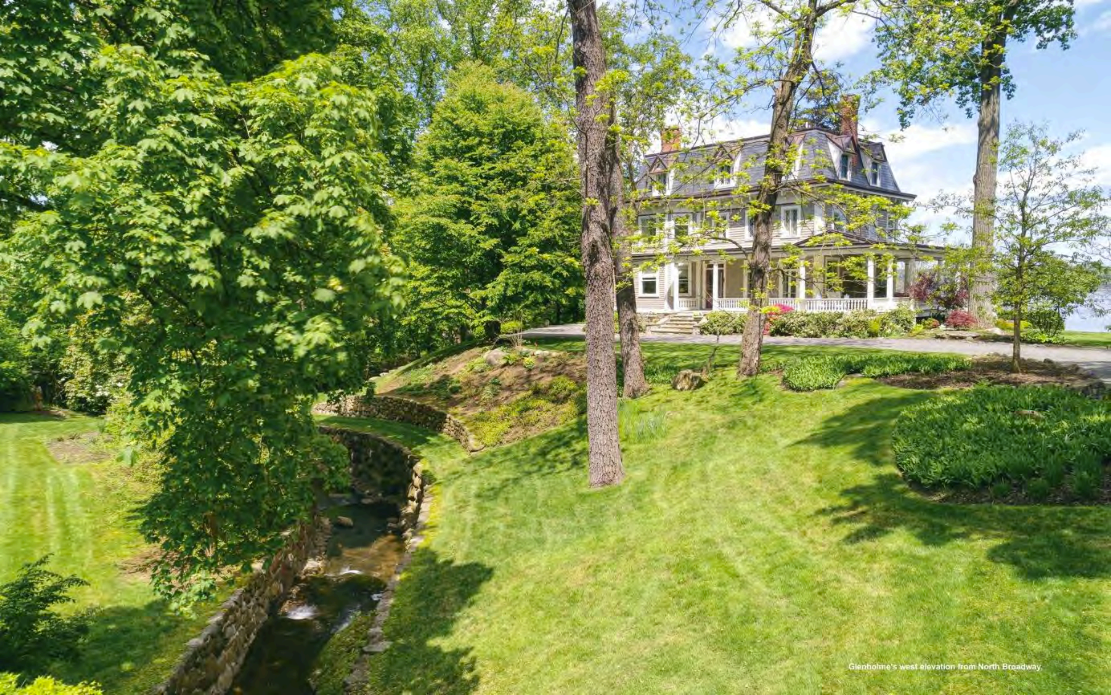
Glenholme's west elevation from North Broadway.