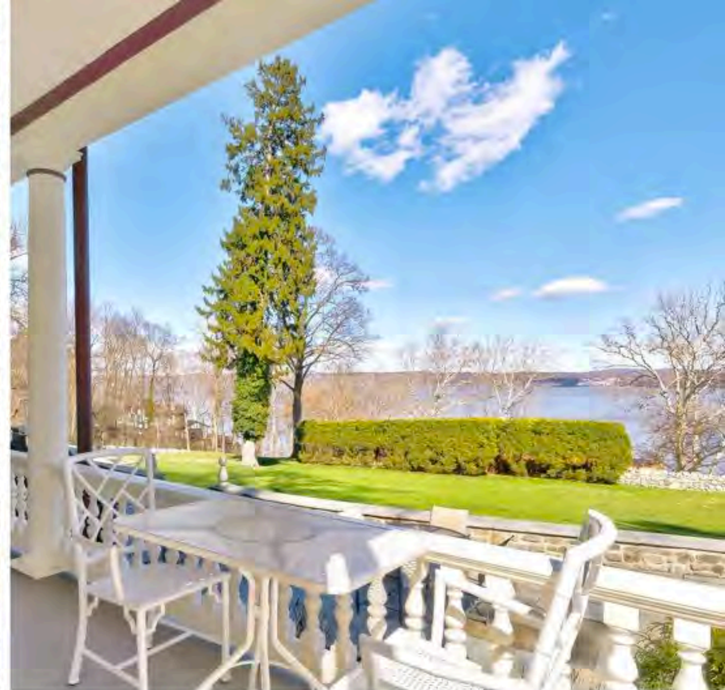
View from the outstanding three sided wrap-around veranda.

and perfectly placed fluted columns is graciously warm and welcoming.