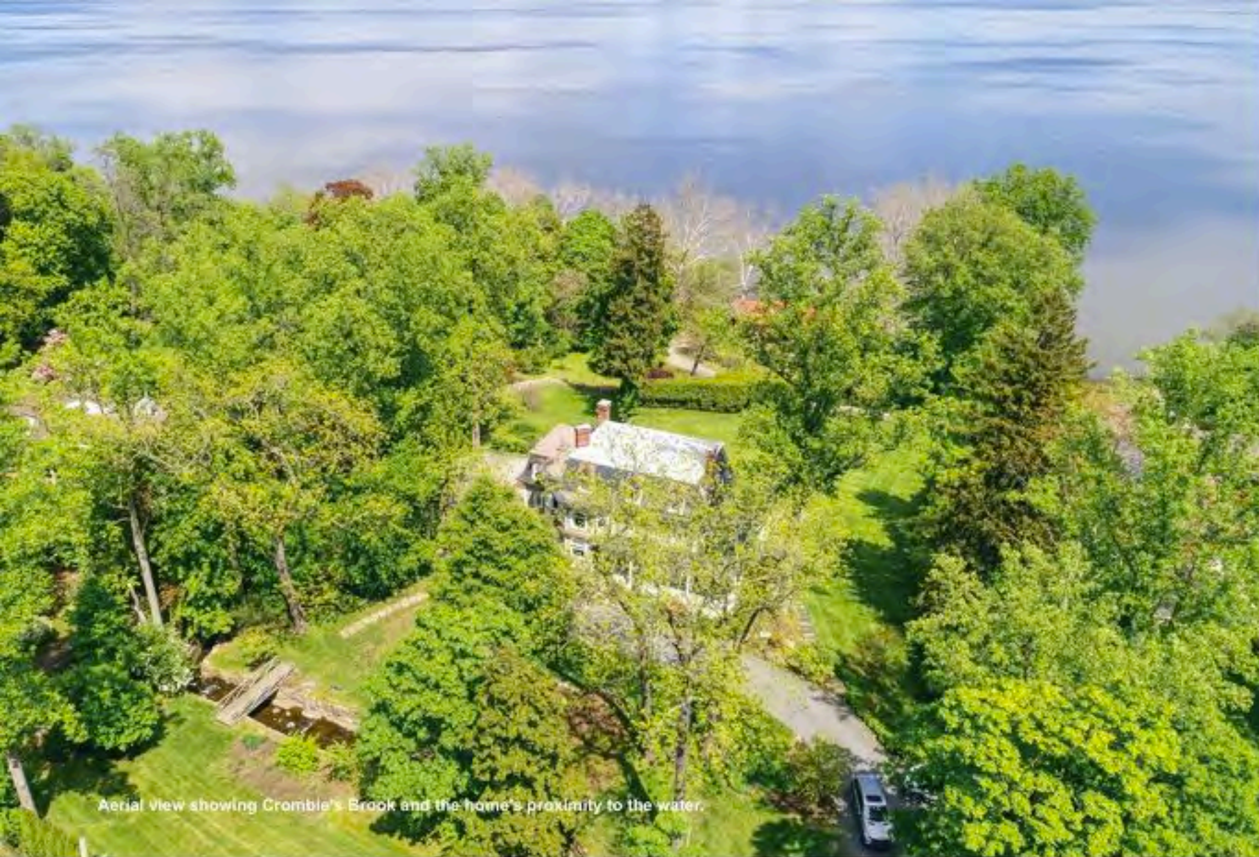
Aerial view showing Crombie's Brook and the home's proximity to the water.