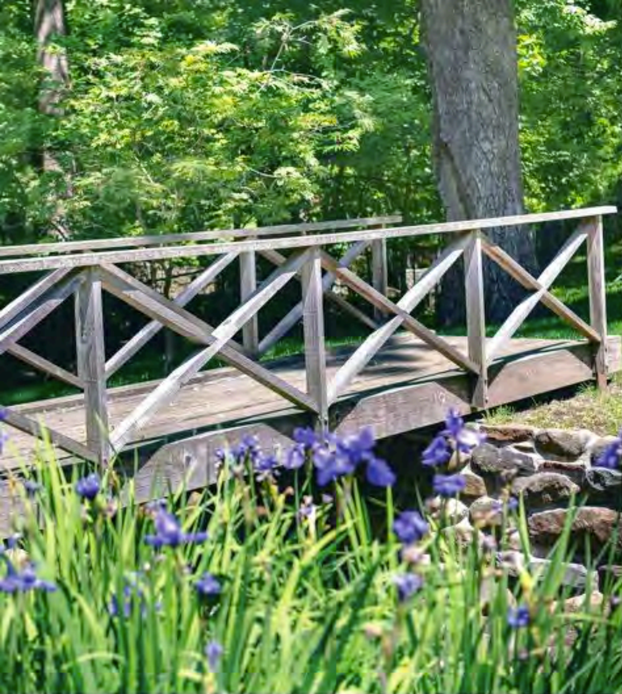
New bridge across Crombie's Brook connecting the manicured gardens; Completely reconstructed stone wall's of Crombie's Brook and multiple cascading waterfalls.