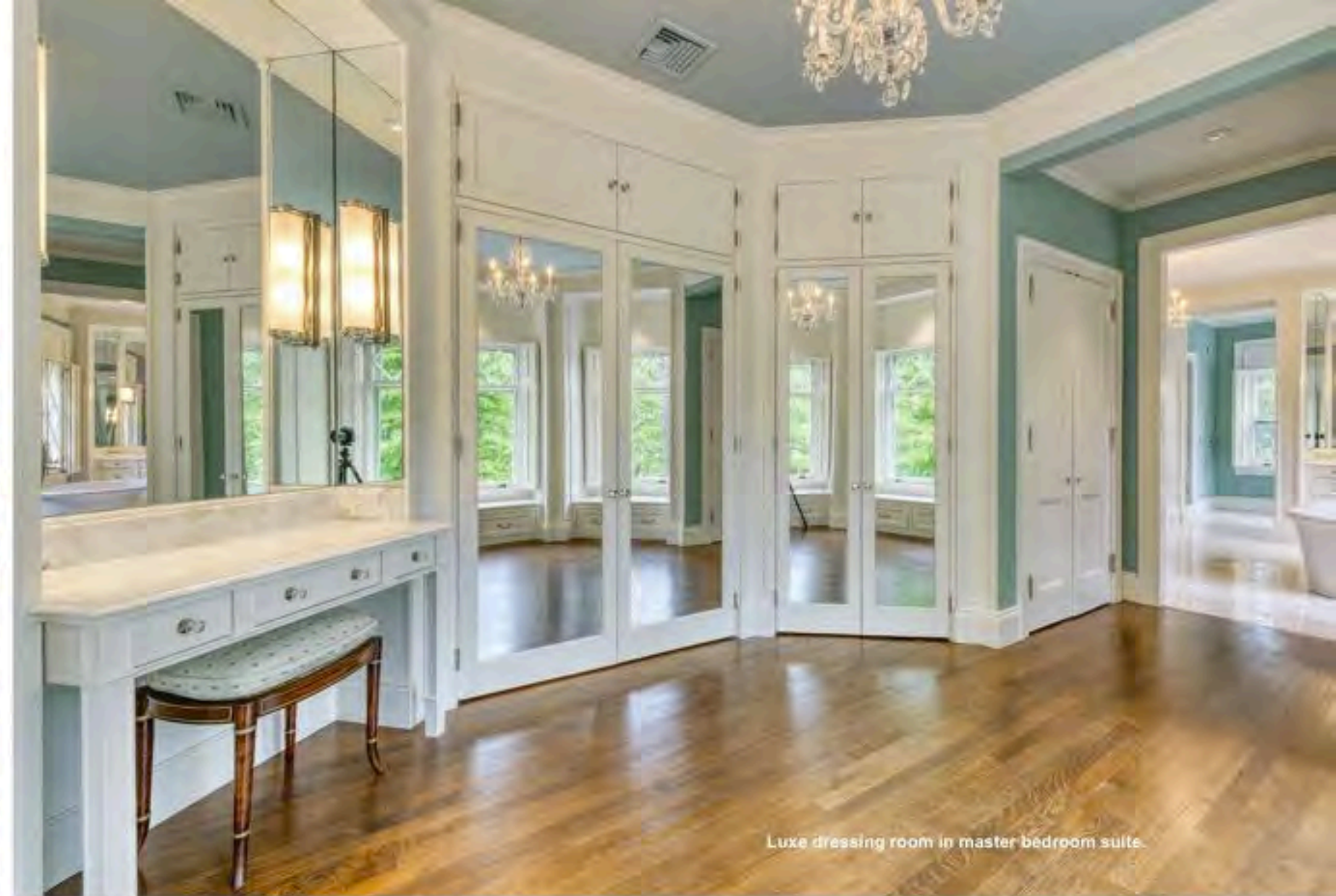
Luxe dressing room in master bedroom suite.